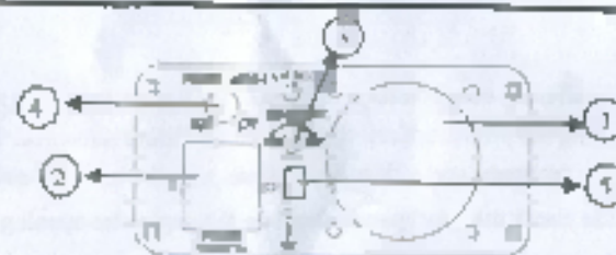
Rear Panel Figure